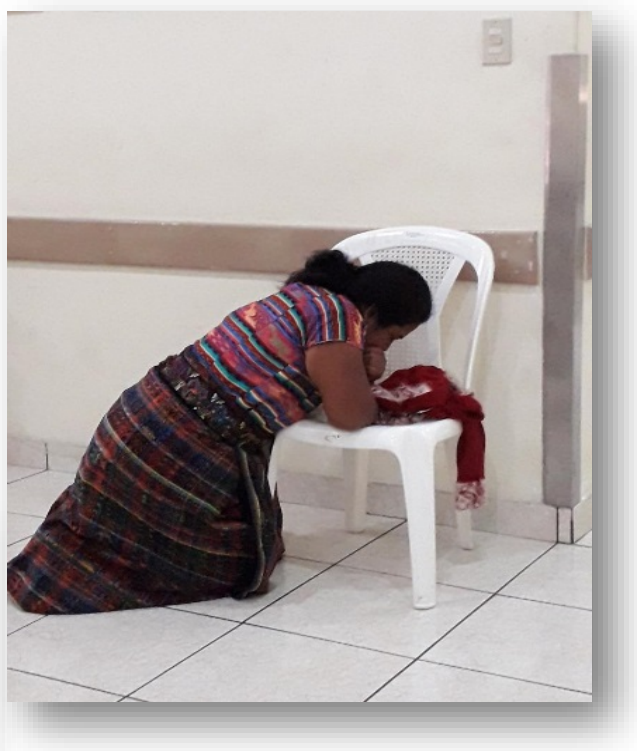
Please remember this young lady and her family in your prayers.

On Thursday, several people went to the chocolate farm and everyone had a good time.